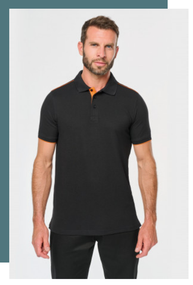
All rights reserved ©