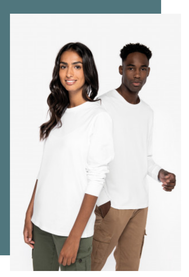
All rights reserved ©